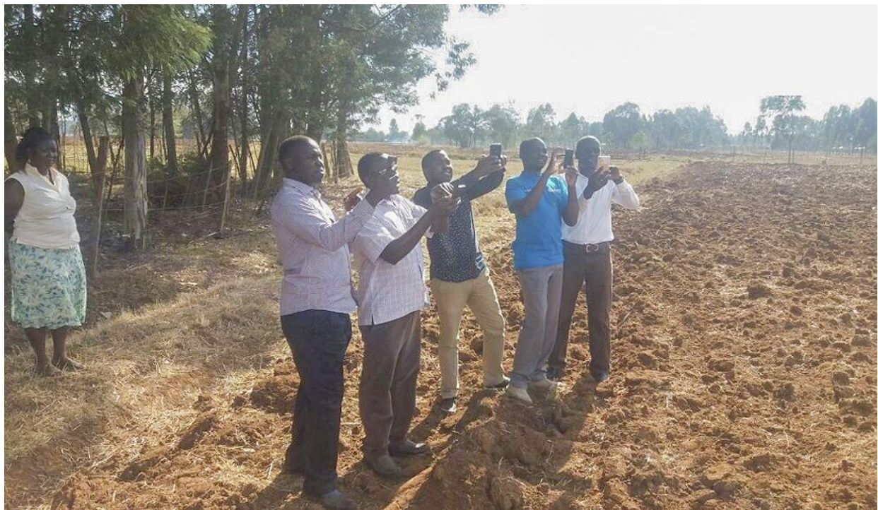
Figure 3. CropMon service in Kenya provides farmers with field-level information. Their fields are registered, based on GPS coordinates, via the local extension officer's smartphone. This picture was taken during a 'training of trainers', where the extension officers are practising registering a farmer on their smartphone.

As the position of each farmer's field is registered in a database, the service can be location-specific. This enables tailored information to be provided. To determine the limiting factor, the service takes account of weather conditions, soil fertility, water supply and other status variables. This information is based on satellite measurements and local soil analysis in the fields. The CropMon approach provides services to farmers cultivating various crops, including coffee, maize, grass, wheat and sugar cane, through four local partner organisations. These organisations have established networks of farmers and are able to spread the technology and ensure fast adoption by users and efficient expansion of the numbers of users.