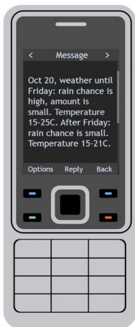
Figure 1: Feature phone with a localised weather forecast for the next week.